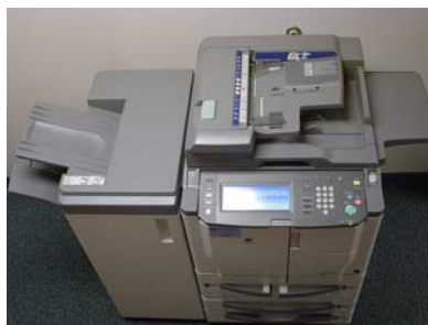
The new machine.

The multifunction machine copies, prints and scans. It runs at 60 pages per minute, an improvement over the already speedy 43 ppm the old machine operated at. The donation of the machine and service contract is valued at $61,344.