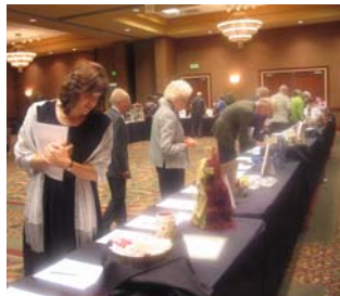
Attendees browse silent auction items.