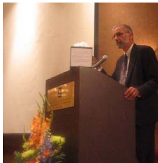
Retired State Senator Frank Shields addresses audience.