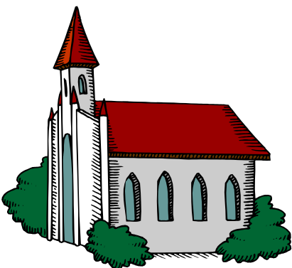
The Israelites brought freewill gifts, each as he could afford until the temple was built. They were so generous that Moses had to tell them to stop giving.

Please consider becoming a “temple builder” with us. Many people are giving more and some cannot give at all. Whatever your situation, we ask God’s blessings on you. If you want to help us with this special project, please mark your gift “Temple Builder” or “Capital Campaign” and it will go directly to help pay off our mortgage.