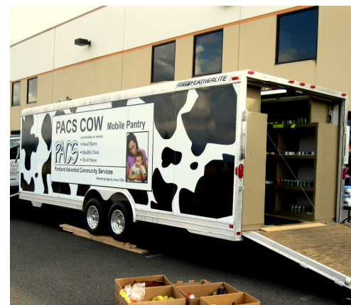
The PACS Cow Mobile Pantry